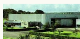
Little Island Engineering