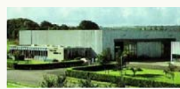
Little Island Engineering