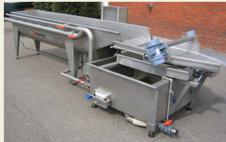
Minimal water consumption because of recycling