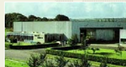
Little Island Engineering