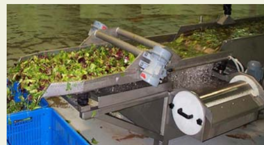
Low friction ensures easy product flow and efficient dewatering