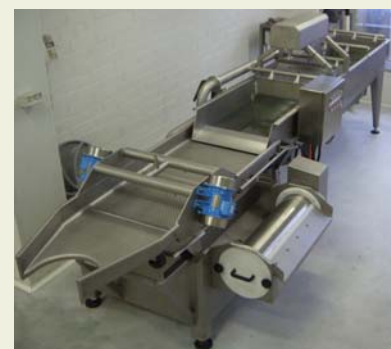
Fully optioned washer.