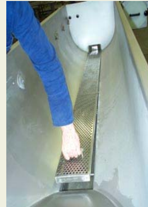
Silt trap with removable screen for easy cleaning