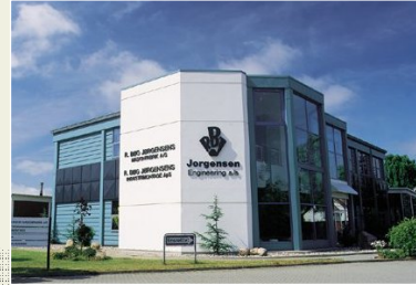
Jorgensen Engineering a/s