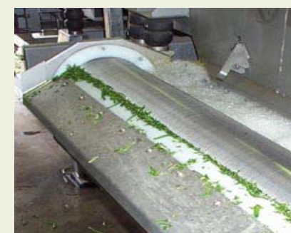
Efficient rotating filter removes impurities