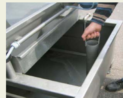
Easy drainage of water