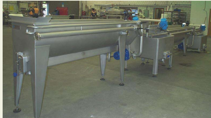
Available in single, double or triple lines, to suit your process

Meanwhile the water passes through a rotating filter for cleaning the water before re-circulation in the wash tank. A silt trap runs the full length of the main tank to remove and hold sand silt etc. away from the product.